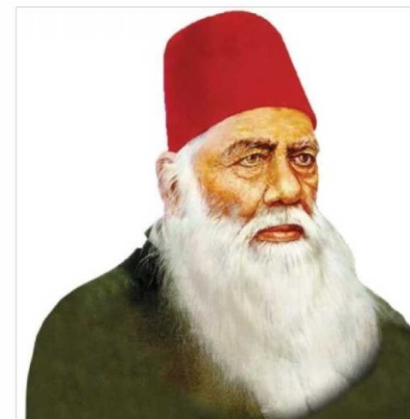
Sir Shayed Ahmad Khan